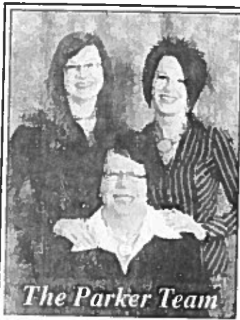
The Parker Team